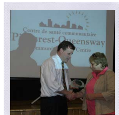
Congratulations Woodroffe United Church!